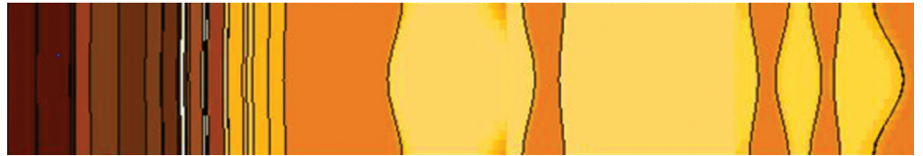
Gamma Ray Image Log

APS Technology's SureLog™ azimuthal gamma ray (AZG™) sensor enables accurate geosteering by adding imaging capabilities to existing APS Measurement-While-Drilling/Logging-While-Drilling (MWD/LWD) measurements. This sensor employs three ruggedized, shielded gamma ray detectors with photomultiplier tubes along with a directional package, which are mounted in a specially designed collar-based system. This system provides protection against the high levels of shock and vibration experienced during drilling, while also providing maximum measurement sensitivity to the formation. This new sensor is designed specifically for low power consumption and is backward compatible with APS's (MWD) system, including the WPR™ resistivity sensor.